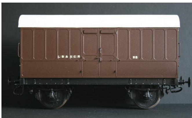
CK15 – LBSC CCT