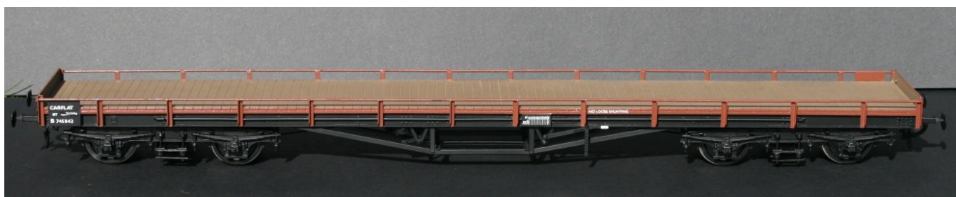
WK10 - BR dia 1/133 carflat