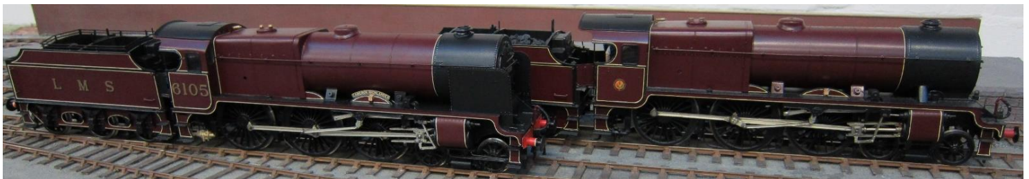
LK 1 – LMS Royal Scot