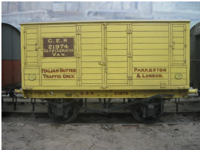
WK20 - GE butter van