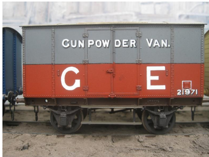
WK9 GE gunpowder van