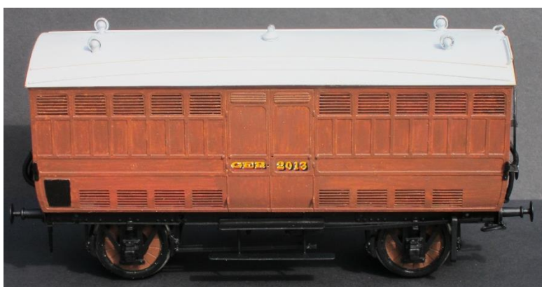
CK22 - GER Meat & fruit van